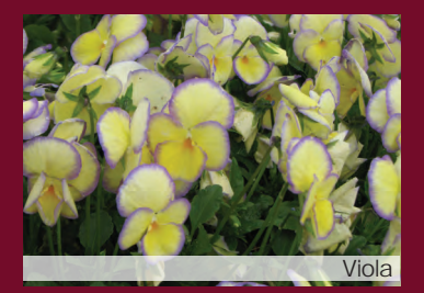
Re-Blooming & Long Blooming Cont... Full Shade - Part Shade Location