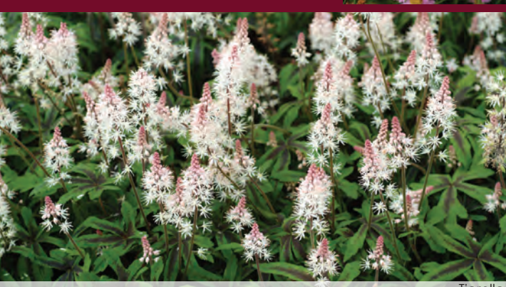
For more information on Late Summer and Long Blooming perennials, visit www.florissa.com